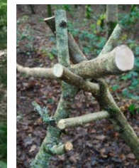
An 'A' frame shelter